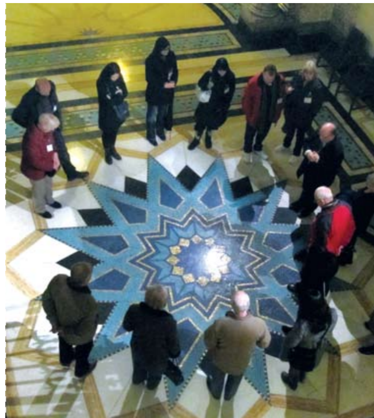
ABOVE A guided tour in progress

The Library and Museum Charitable Trust of the United Grand Lodge is a registered charity No 1058497.